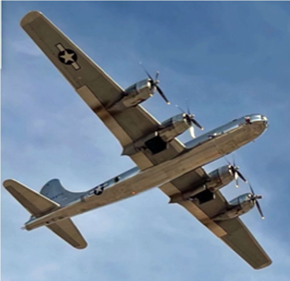
Boeing B-29 Superfortress "Doc" Overhead View

Airport on Thursday May 26th. There were a lot of Chapter members checking out the plane and few even went for a ride!