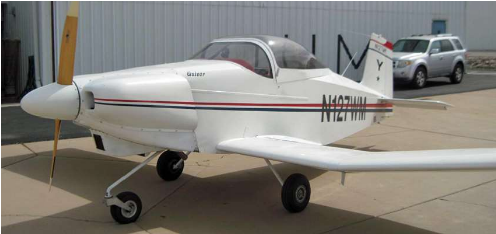
Chapter 1217 member A.J. Reynolds new Thorp T-18

So, if you want a backup to your backup plan, why not take a peek.