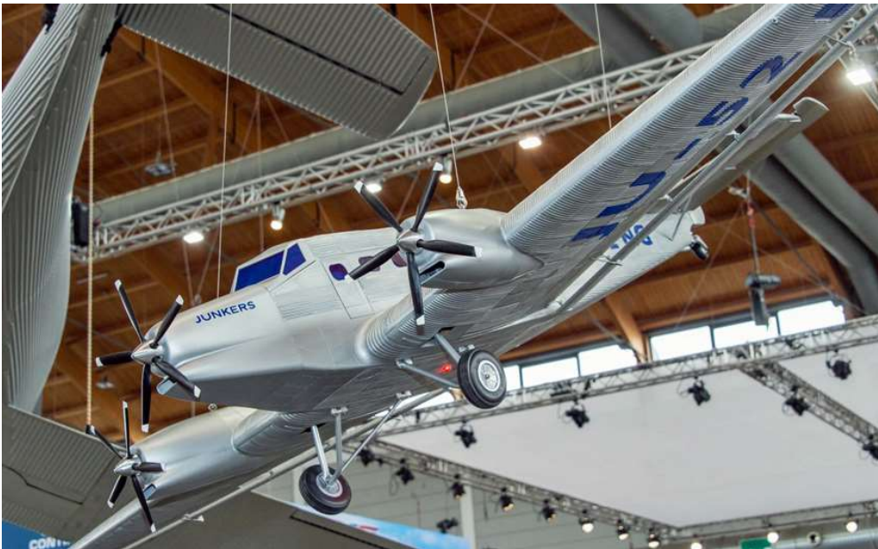
Concept Model of Junkers JU-52 NG

“The absolute highlight, however, is the use of the JU-52 NG for sightseeing flights. There is no better aircraft than the JU-52 NG for this type of flight. “Imagine sitting as one of 14 passengers in the JU-52 NG, each with their own window seat, flying slow and low in front of the New York skyline. An experience you will never forget!”