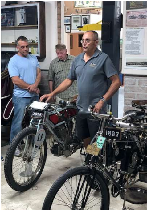
Three Wheel Motorcycle built in 1897

Please note availability for lodging is subject to change. Plan in advance for the event and make sure you have confirmation numbers if needed.