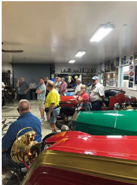
Alan's Cars Showed Great Attention to Detail