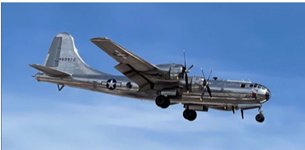
Boeing B-29 Superfortress "Doc" on Final