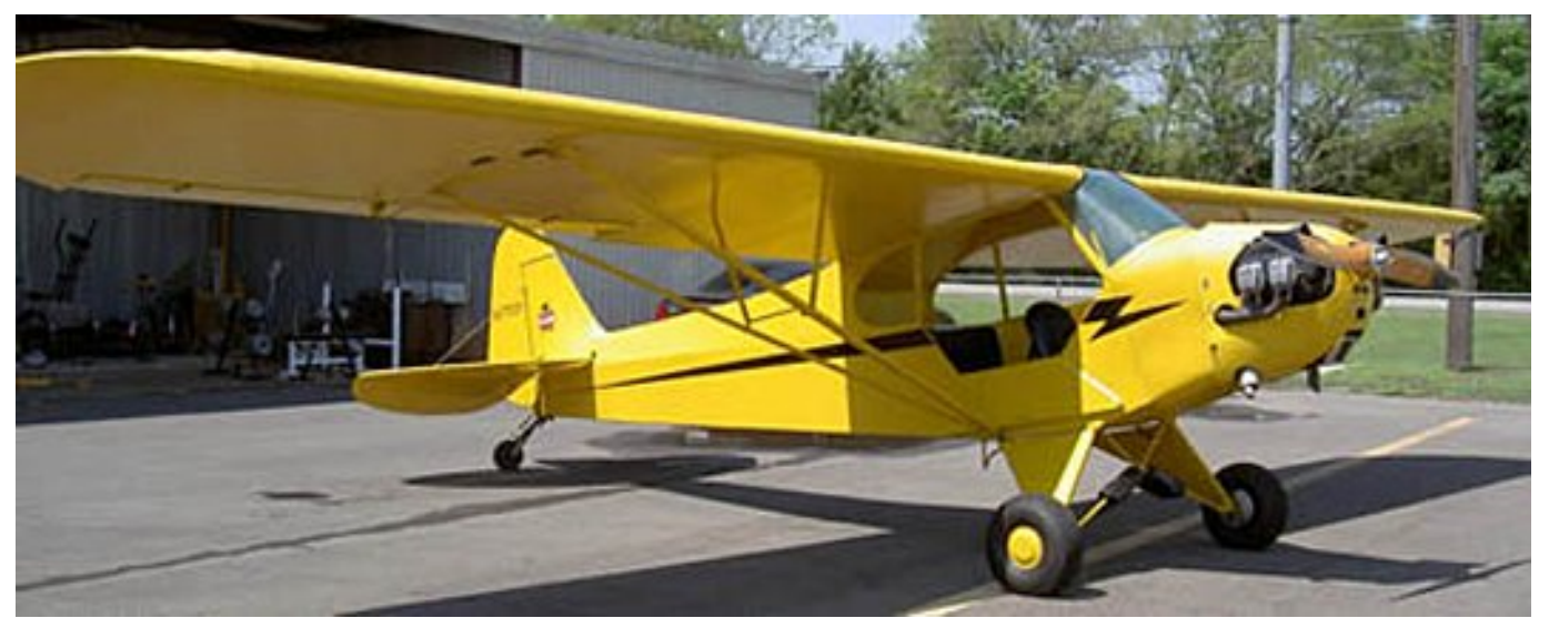
The Kassik's Newly Acquired J-3 Cub