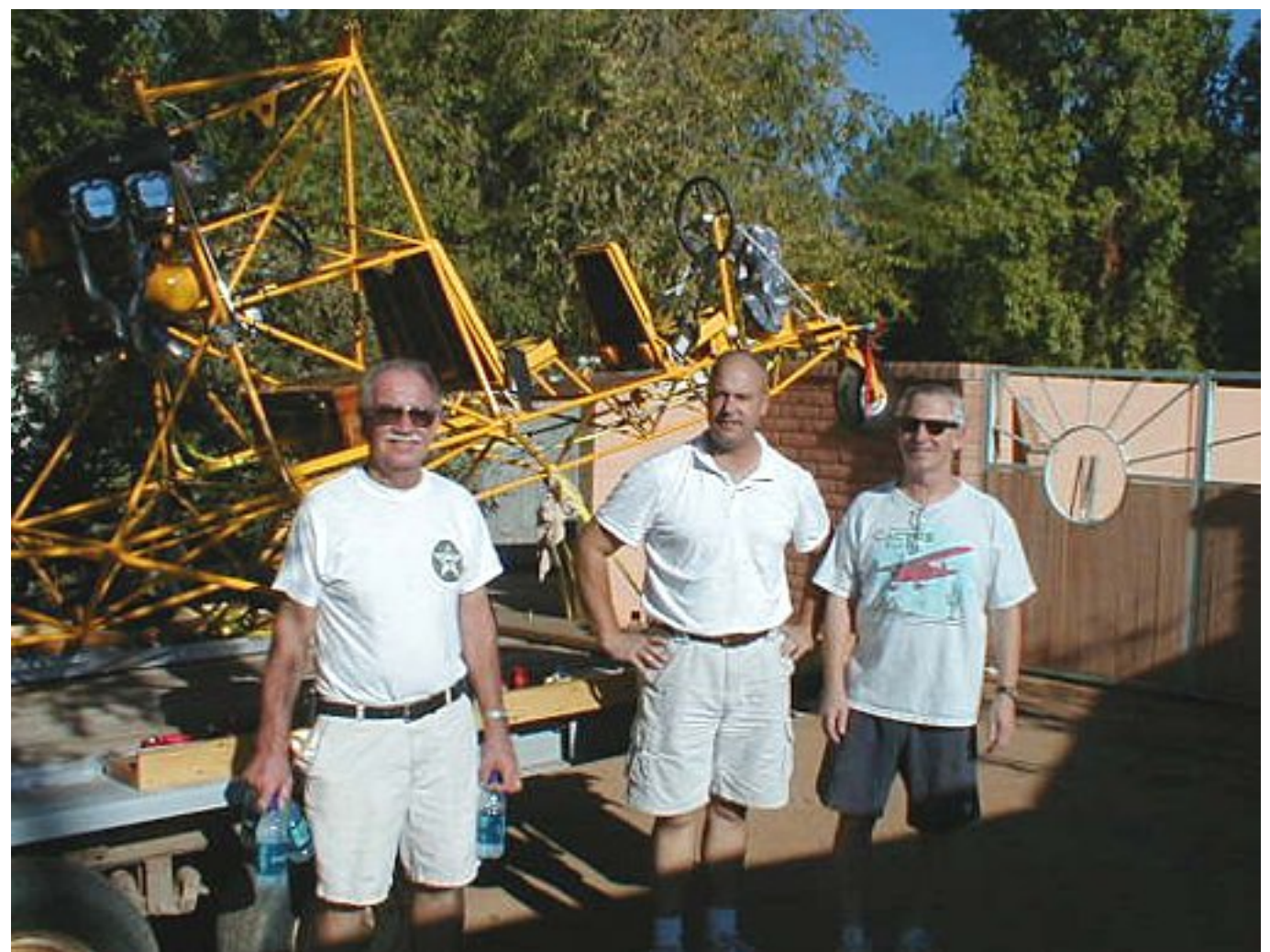
Strong Arms, Cool Heads, Shorts, and Water are a Must for Moving a Breezy