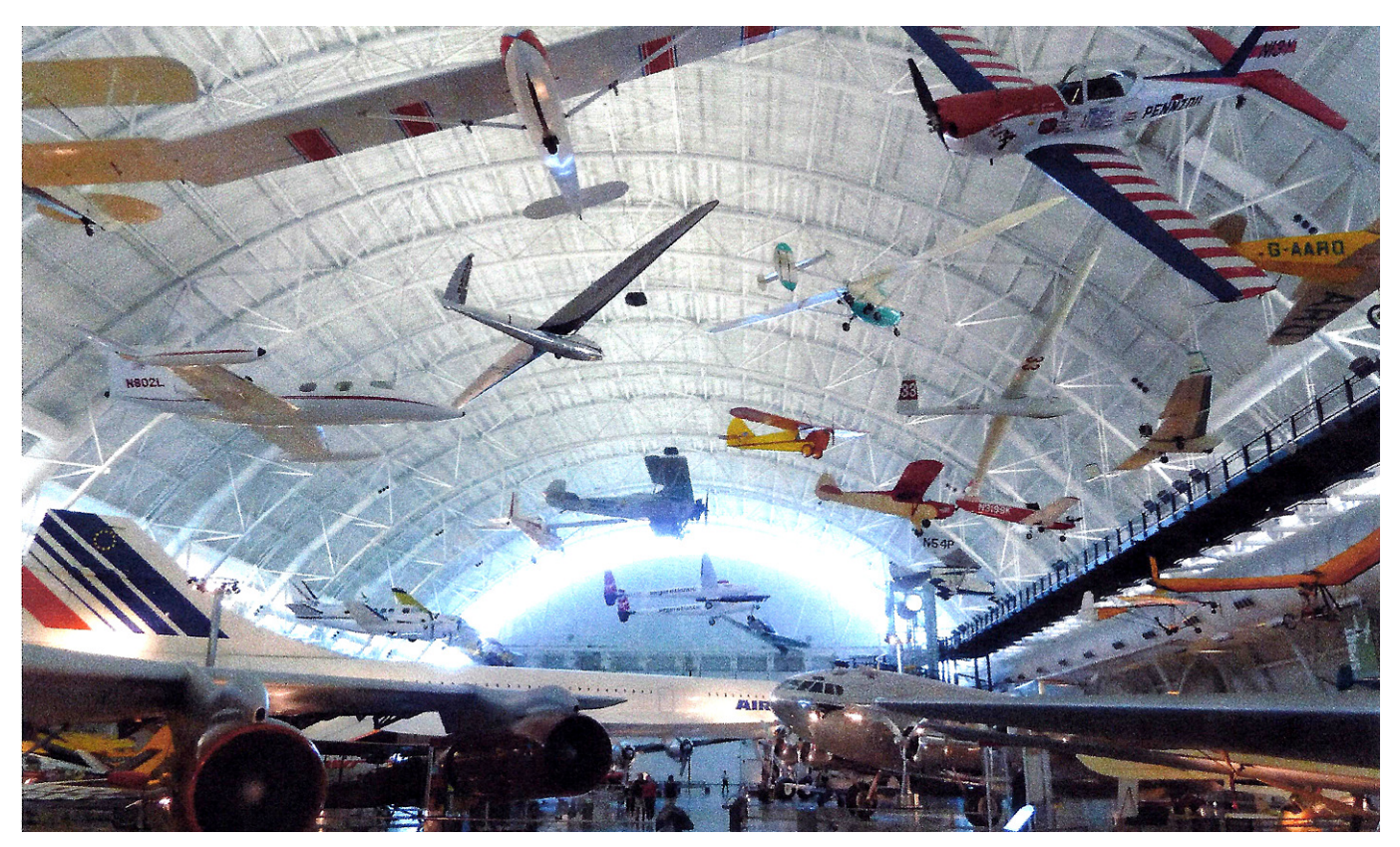
Aircraft on Display at the Steven F. Udvar-Hazy Center