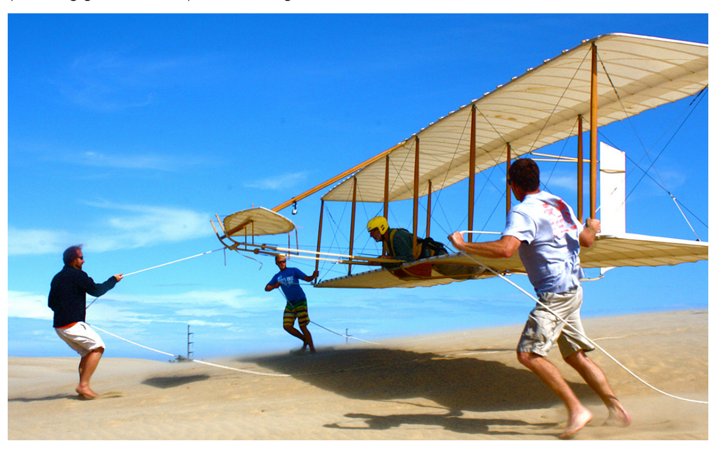
Another Pilot begins the "Wright Experience" in the Kitty Hawk Kite

http://www.kittyhawk.com/adventures/1902wright-glider-experience