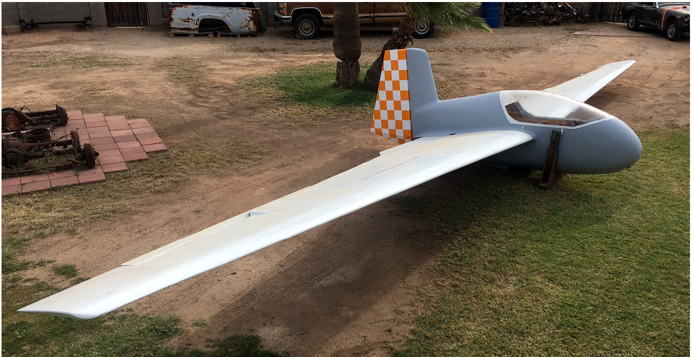
Another view of Hayden Newhouse's Marske Pioneer 2B Sailplane, those Wings are Long