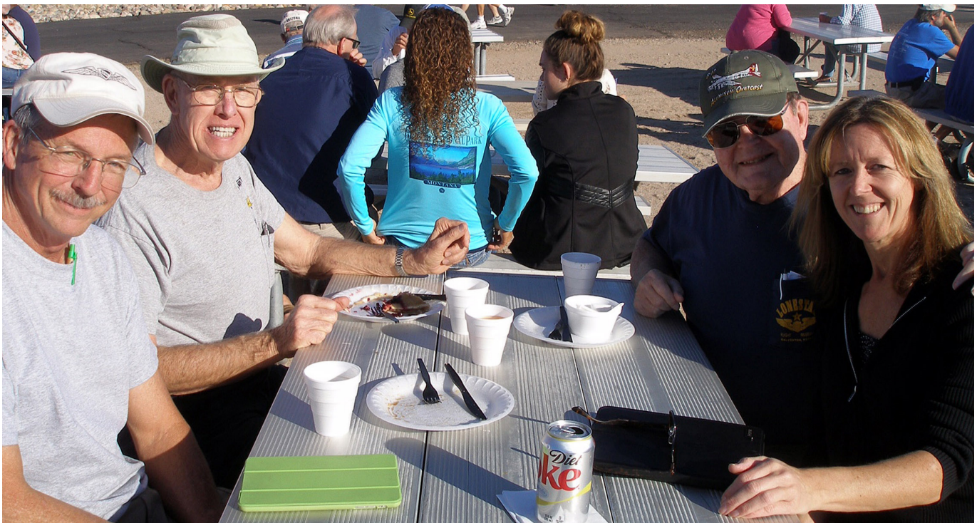
Chapter 1217 Members enjoying Lunch at the Wickenburg Air Show