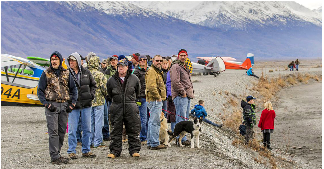
Spectators Waiting for the Next Pumpkin Drop