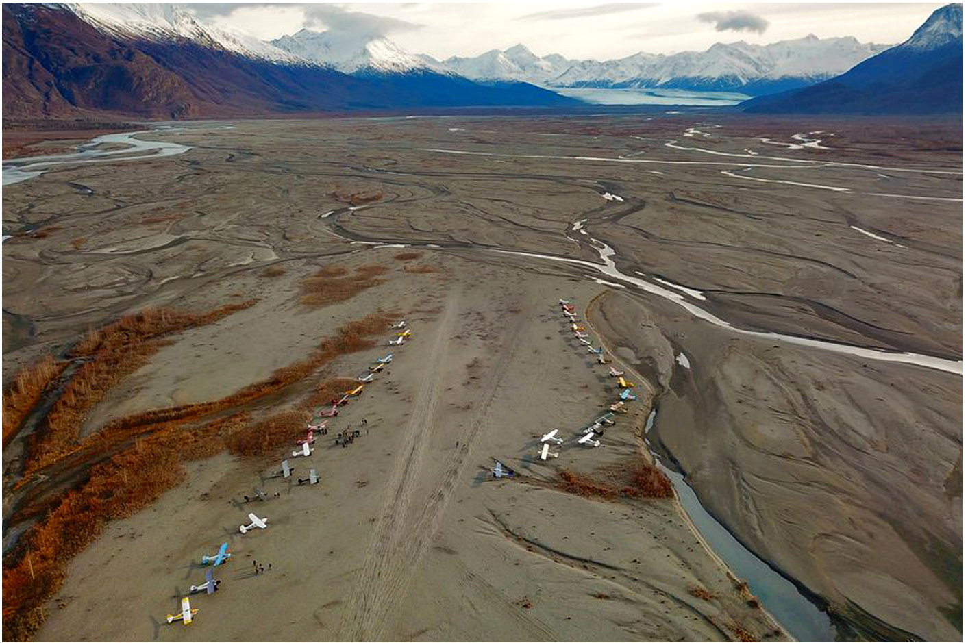
Knik River Valley, the location of the Great Alaskan Pumpkin Drop