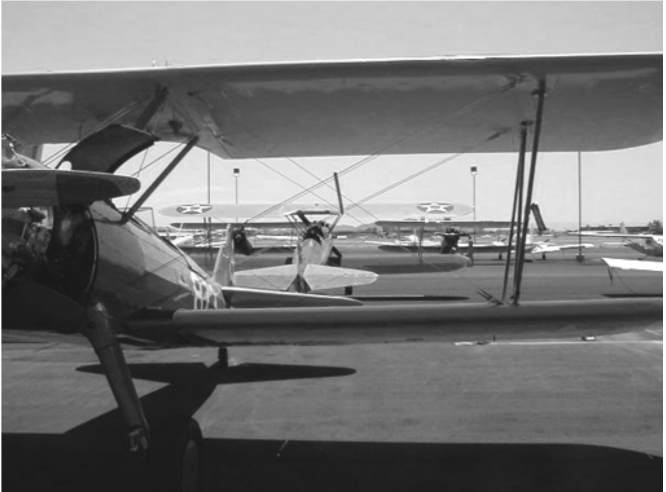
Biplanes Everywhere – Seven Stearmans Showed Up