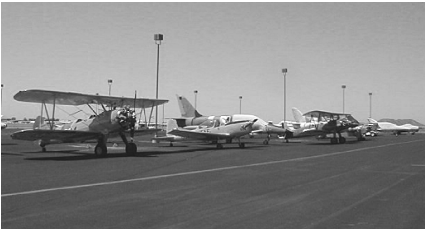
Some Planes In Attendance