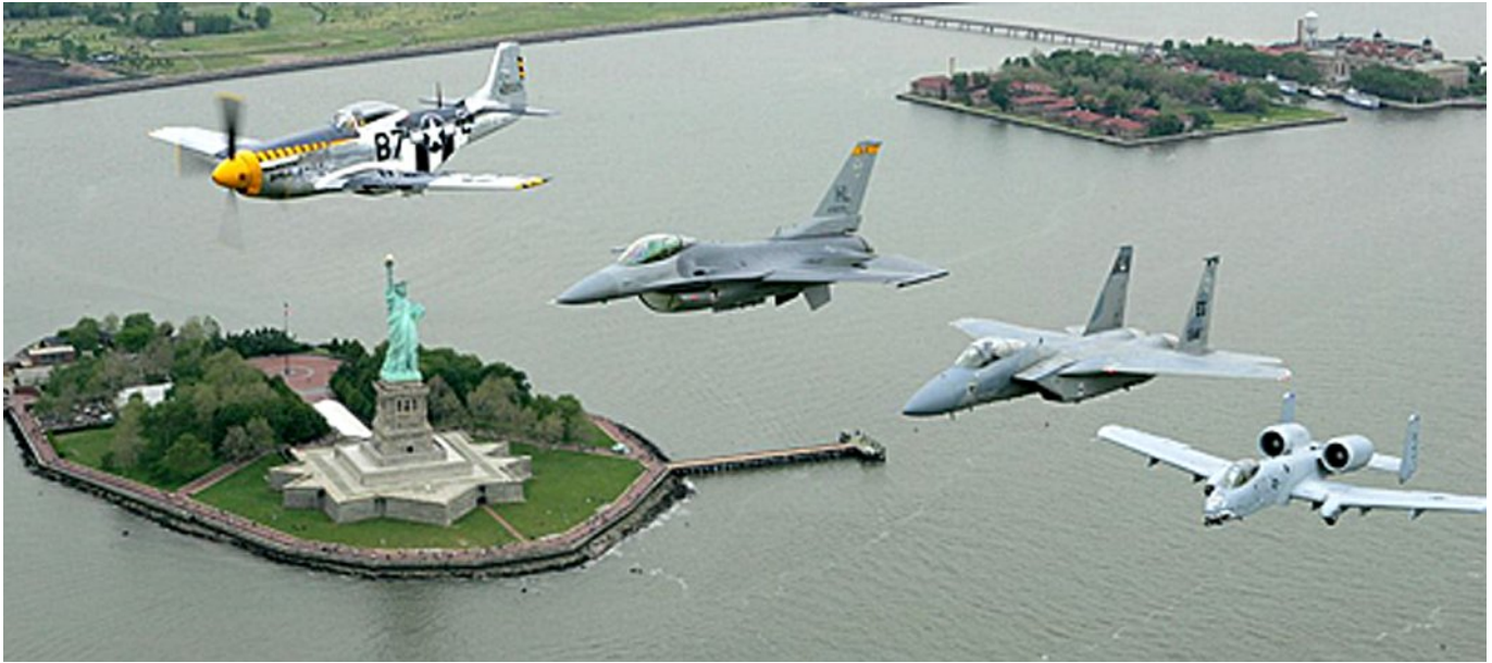
Lady Liberty Greets the Defenders of our Freedoms

Thunderbird Field EAA Chapter 1217 5450 East Voltaire Scottsdale, Arizona 85254