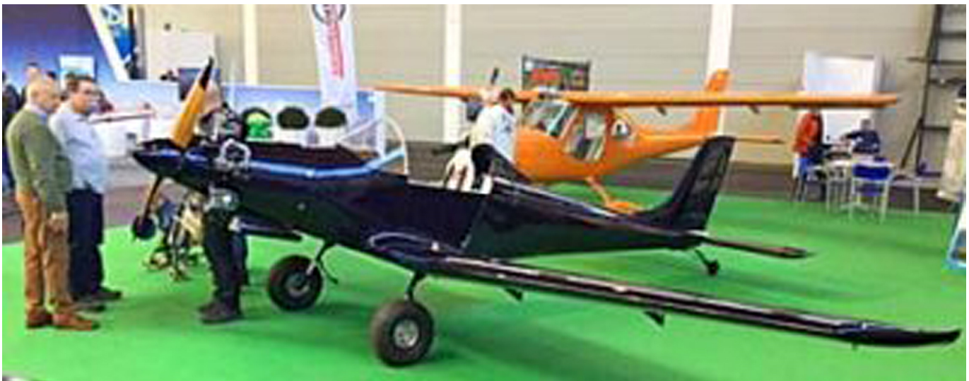
New all-composite Sportster just unveiled with a Verner Radial Engine

The Pima Museum is home to more than 350 aircraft, from a Wright Flyer to a 787 Dreamliner. Over the past 40 years, the museum has grown to include six indoor exhibit hangars. The museum is also the exclusive operator of bus tours of the 2,600-acre "Aircraft Boneyard," the U.S. military and government aircraft storage facility.