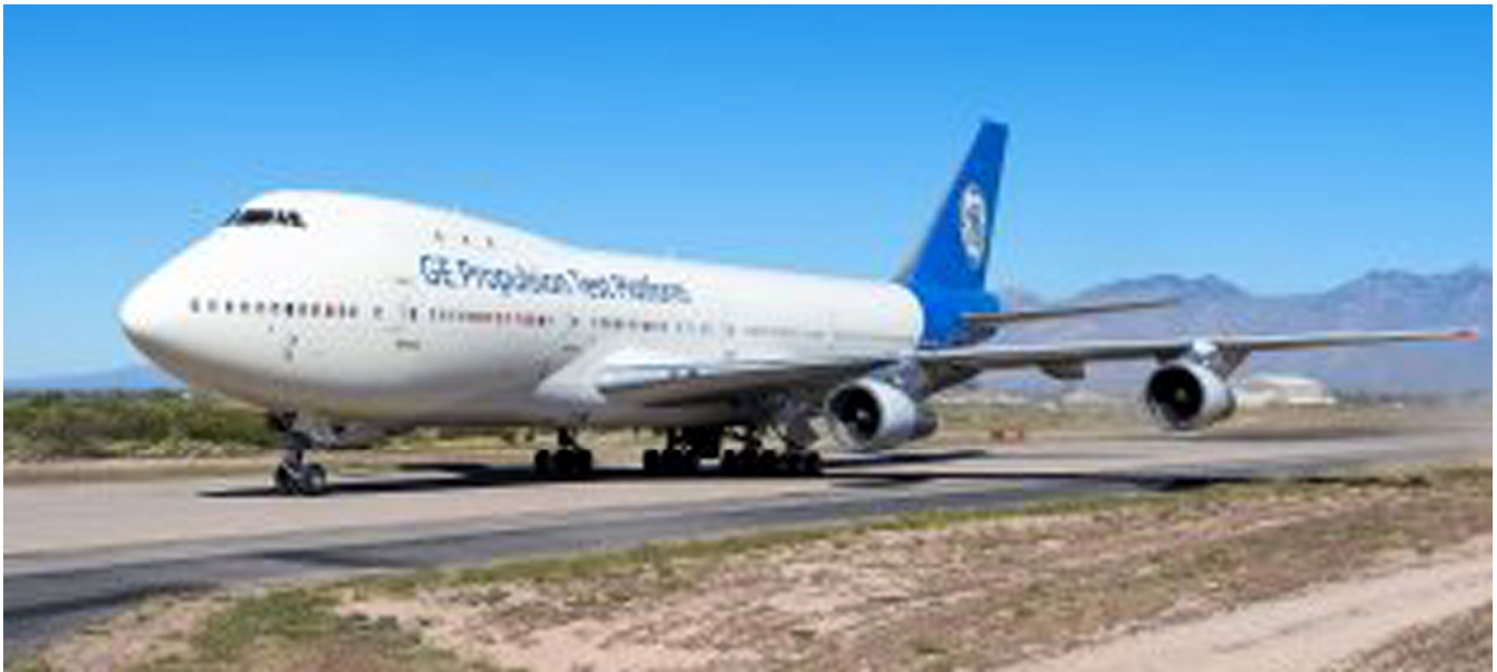
GE 747 flying test bed landing after making its last flight