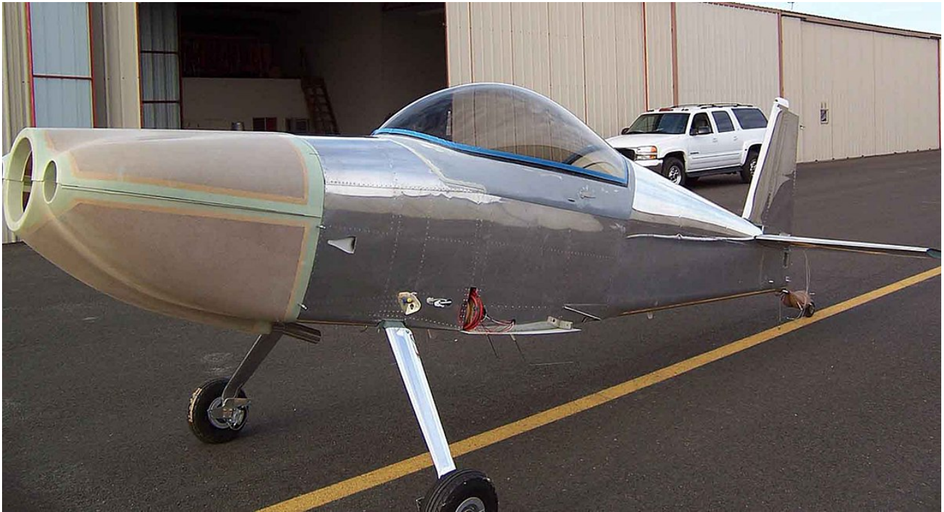
Larry Keeling's RV-8 fastback showing the Showplanes.com turtleback, canopy, and cowling

Mustangs Unlimited creates 1/5th scale aircraft replicas to use as weather vanes, hangar art, or home décor. The airplanes are individually crafted of fiberglass with a propeller that turns in the wind. Each aircraft weathervane is painted to the buyer's specifications. The wingspan is 7 feet; the fuselage is 6 feet long and each plane weighs 45 pounds. Choose from Mustangs, Spitfires, Corsairs, or Air Tractors. For more information, visit www.FlyingVanes.com .