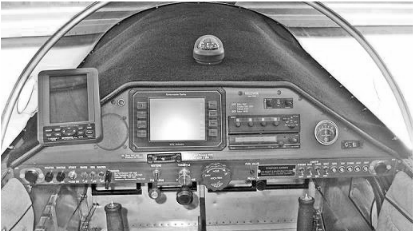
Waix Instrument Panel