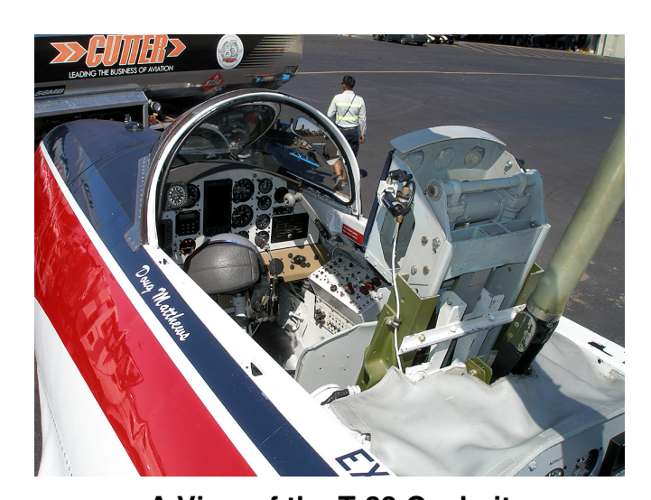
A View of the T-33 Cockpit

Specifically, the new application procedures require the individual processing the application to verify that all the applicant's eligibility requirements are met - including that the applicant is at least 16 years old at the time of the application. Given the wait time for the FAA to issue the student pilot certificate, the possibility of soloing on the sixteenth birthday seems remote. The FAA has issued an updated advisory circular (AC 61-65F) on pilot certification that includes the changes in student pilot certification.